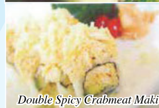
Double Spicy Crabmeat Maki