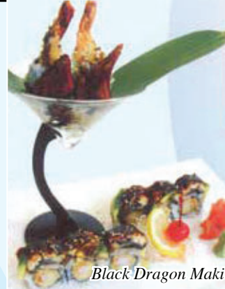
Black Dragon Maki

Consumers that consuming raw or undercooked meats, poultry, seafood, shellfish, or eggs may increase your risk of food borne illness, especially if you have certain medical conditions