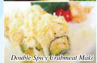
Double Spicy Crabmeat Maki