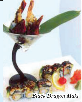
Black Dragon Maki

Consumers that consuming raw or undercooked meats, poultry, seafood, shellfish, or eggs may increase your risk of food borne illness, especially if you have certain medical conditions