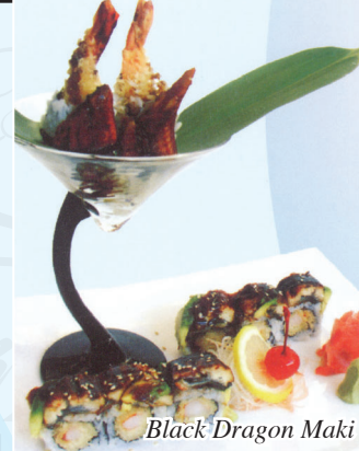
Black Dragon Maki

Consumers that consuming raw or undercooked meats, poultry, seafood, shellfish, or eggs may increase your risk of food borne illness, especially if you have certain medical conditions