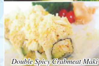
Double Spicy Crabmeat Maki